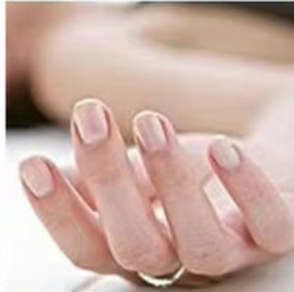
Cure Ringworm of The Nails