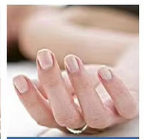
Cure Ringworm of The Nails