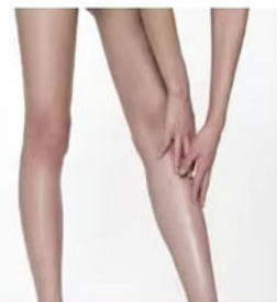
Blood Vein Removal