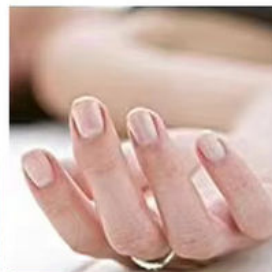
Cure Ringworm of The Nails