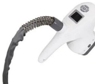
handle 2 for body