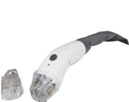
handle 1 for face