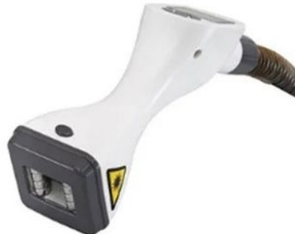
handle 4 for body