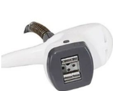
handle 3 for body