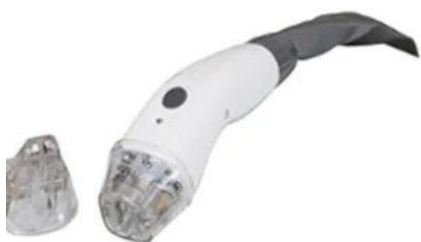
handle 1 for face