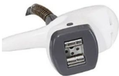
handle 3 for body