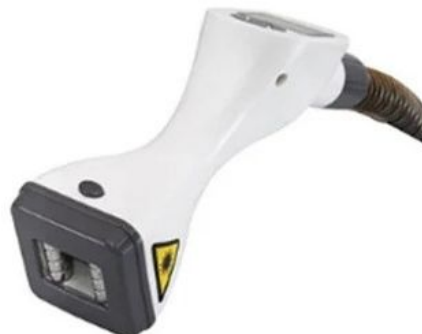
handle 4 for body