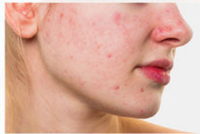
Reduce acne marks